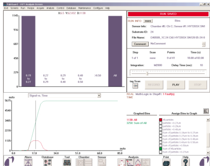
Figure 2. HYT particle counts for a wafer with abnormally high particle counts.

Figure 1 and Figure 2 show that the HYT sensor can easily distinguish between low and high particle counts in an etch preclean chamber. Figure 13 shows the particle counts for a normal wafer. The lower plot shows the time series data from two Bins: the number of particles of any size for each time interval (red) and the cumulative sum from wafer start of the number of particles of any size (green). The maximum number of particles for any one-time interval was 162. The total number of particles accumulated over the entire process was 402, which was typical for this process. The upper left plot indicates that essentially all of the particles were small, 0.19 to 0.27 microns, which was typical for this process.