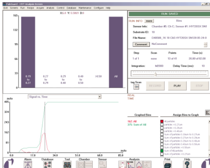
Figure 1. HYT particle counts for a normal wafer.

One of the benefits of FabGuard to your process is using data from more than one type of sensor. In this case, an HYT in situ particle monitor was used with data from the processing tool to detect, and determine the cause of, unacceptably high particle levels.