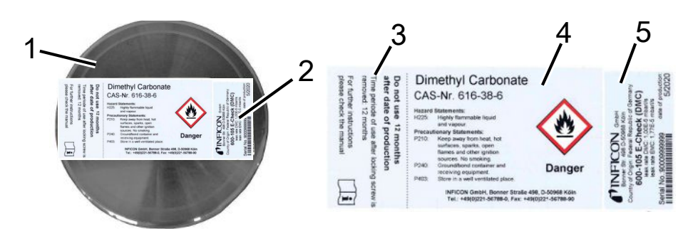
Fig. 1: View from above