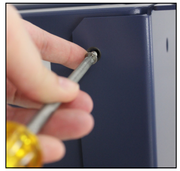
Figure 7 Use screws to attach unit to brackets

7 Micro GC Fusion is now attached to the rack. (See Figure 8.) Figure 8 Rack mounted Micro GC Fusion