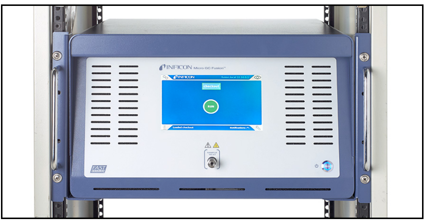
Figure 5 Micro GC Fusion set on mounting brackets

5 Line up the holes on the bottom of the unit to the holes in the brackets. (See Figure 6.) Figure 6 Align unit with bracket holes