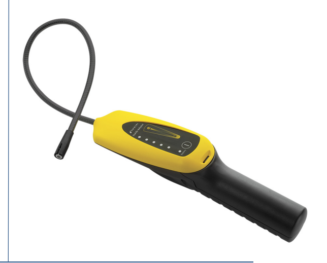
GAS-Mate® Combustible Gas Leak Detector