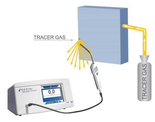
Assembled hydrogen tanks are often tested by hydrogen sniffing.