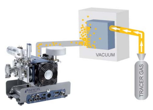
Hydrogen tank bodies are tested by vacuum chamber testing for high throughput manufacturing.

Hydrogen tanks are typically tested via helium vacuum chamber leak testing to achieve short cycle times and high throughput. Due to the large volume of the tanks and the rather large allowable leak rates, typically helium mixed with air is used as tracer gas. The hydrogen tank is filled with a small amount of helium first and then backfilled with air to operating pressure so that the resulting gas mixture in the tank contains about 5 - 10% helium. The hydrogen tank is then placed in a vacuum chamber. The chamber is evacuated and once the final vacuum pressure is reached, an LDS3000 leak detector is connected to the vacuum chamber and helium escaping from the hydrogen tank is detected by the LDS3000. The threshold leak rate needs to be adapted to the used helium concentration in the tracer gas. The used tracer gas can be reclaimed for consecutive testing.