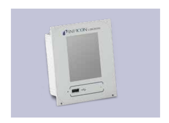
CU1000 CONTROL UNIT