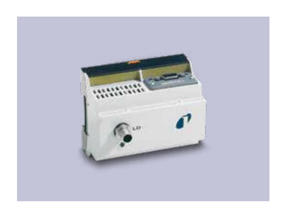
BM1000 BUS MODULE