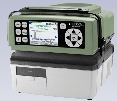
Service Module: allows for general maintenance and can be used as an alternate source of vacuum during stationary operation.

HAPSITE SituProbe: for lab-quality water analysis through a modified purge and trap system. Use it to analyze individual samples for continuous stream analysis, with detection limits into PPT range.