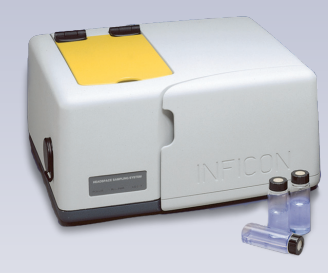
HAPSITE HeadSpace Sampling System: for highly accurate on-site analysis of VOCs in water, soil, and solids, with detection limits into PPT range.