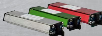
From left to right: refrigerant sensor 724-701-G1, CO 2 sensor 724-701-G2, and flammable refrigerant sensor 724-701-G3.