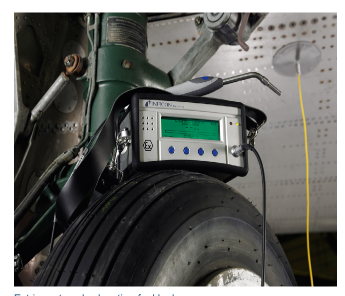
Extrima at work—locating fuel leaks