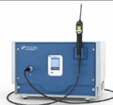
XL3000flex Helium and Hydrogen Leak Detector

The high-performance sniffer leak detectors from INFICON are designed for highly accurate industrial leak testing and include among others the XL3000flex helium and hydrogen leak detector , for full-time sniffing in demanding production environments, and the Sentrac hydrogen leak detector , with its unique ability to handle small and large leaks, both in production and repair lines.