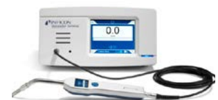
Sensistor Sentrac Hydrogen Leak Detector