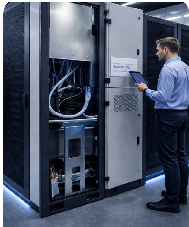
Prototype of in-row CDU in data center environment. Final testing of assembled systems is critical to ensure coolant stays completely contained once the CDU is installed. Image generated by AI