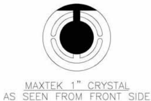
Figure 2. 1" Crystal - as Seen From The Front Side