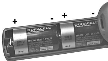
Figure 1. Properly installed alkaline batteries

DURACELL® is a registered trademark of Duracell, Inc., Bethel, Connecticut.