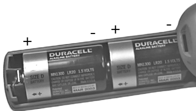
Figure 1. Properly Installed Alkaline Batteries